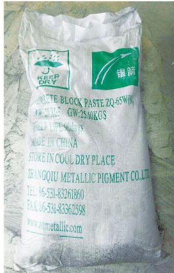
Aluminum paste for AAC Package