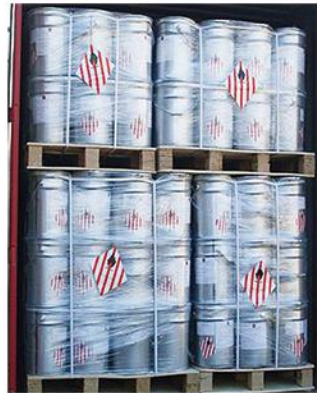
Standard Steel Drum

Note: Information presented herein has been complied from sources considered to be dependable and reliable and is accurate to the best of our knowledge and belief but is not guaranteed to be so. Since conditions of use are beyond our control, we make no warranties expressed or implied except those that may be contained in our written contract of sale or acknowledgment.