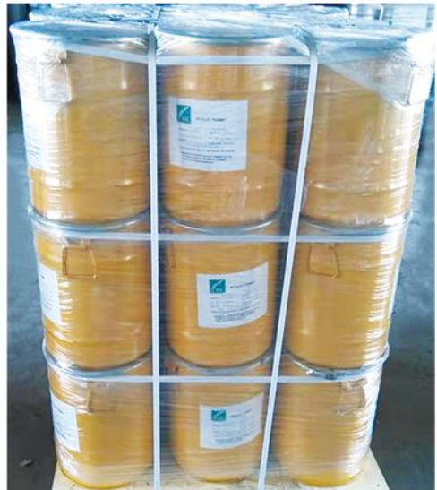
Bronze Powder Package