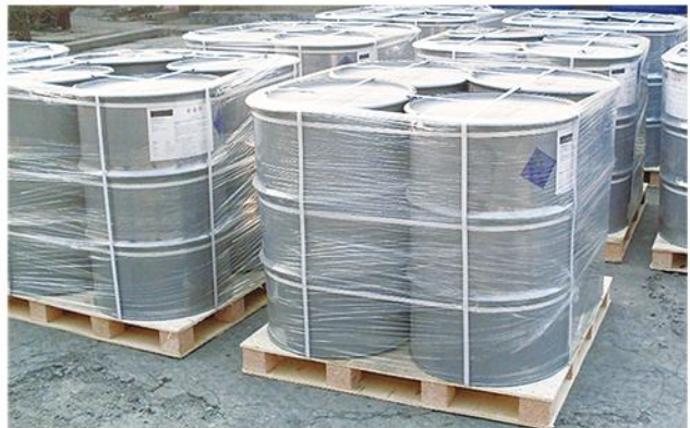
Spehrical Aluminum Powder Package